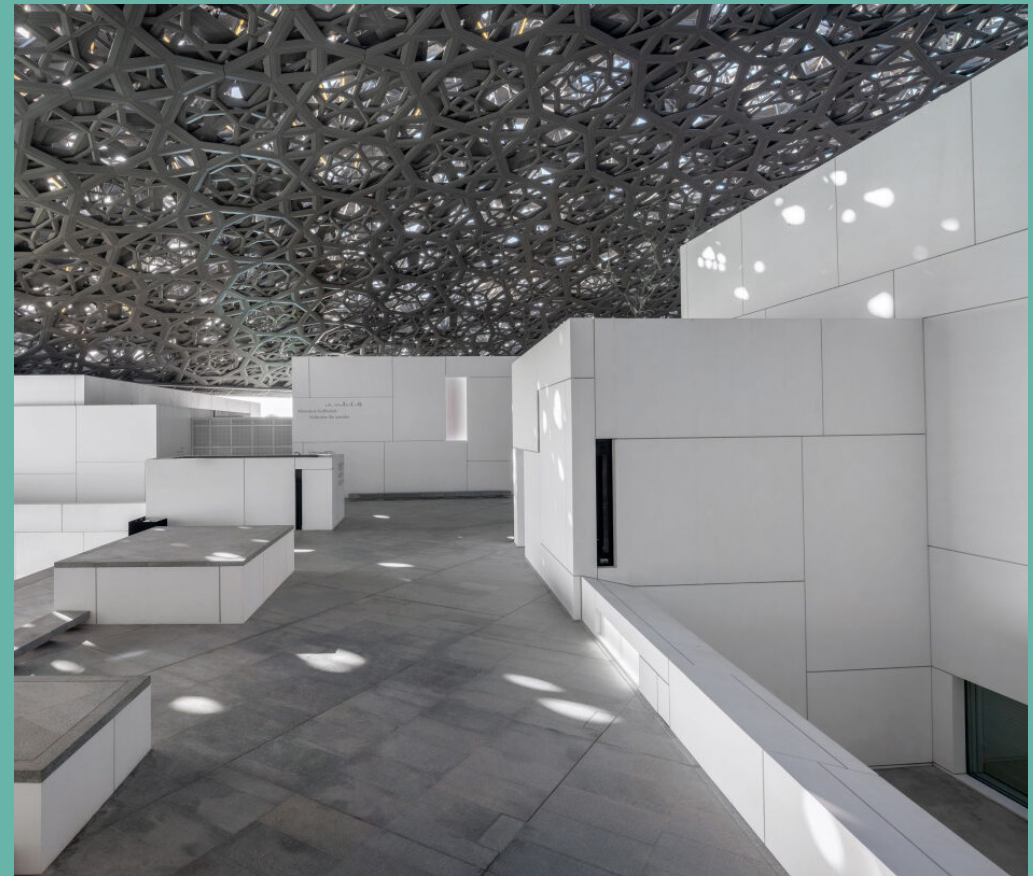
© Department of Culture and Tourism – Abu Dhabi / Photo Yiorgis Yerolymbos