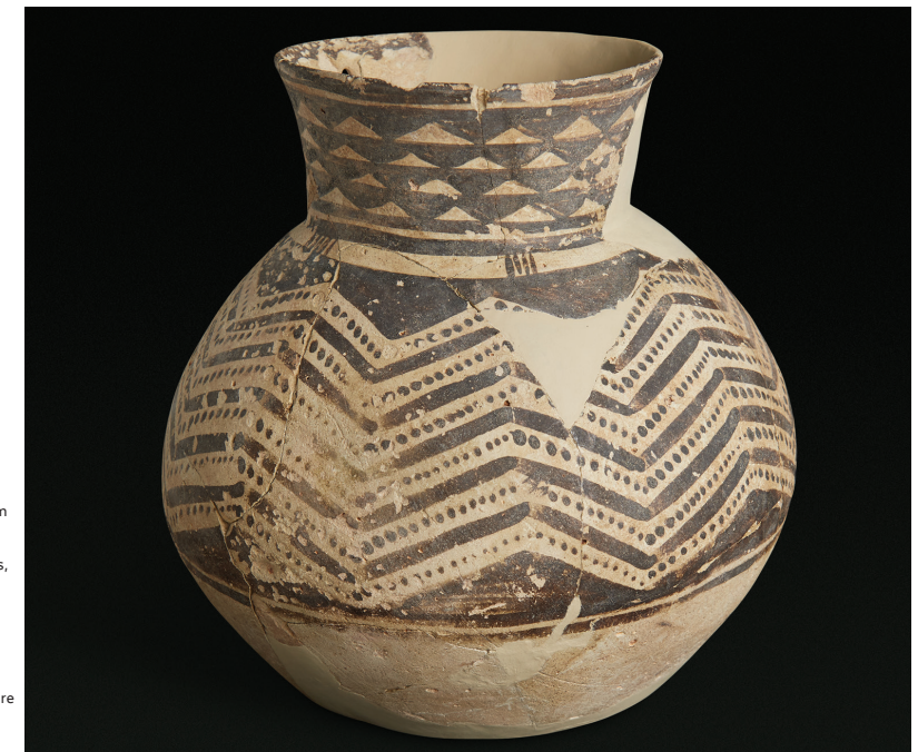
Vase with geometric motifs imported from Mesopotamia United Arab Emirates, Abu Dhabi, Marawah Island About 5500 BCE Painted terracotta Department of Culture and Tourism - Abu Dhabi

Curriculum links: Social Studies , Science , Identity , Geography , Biology