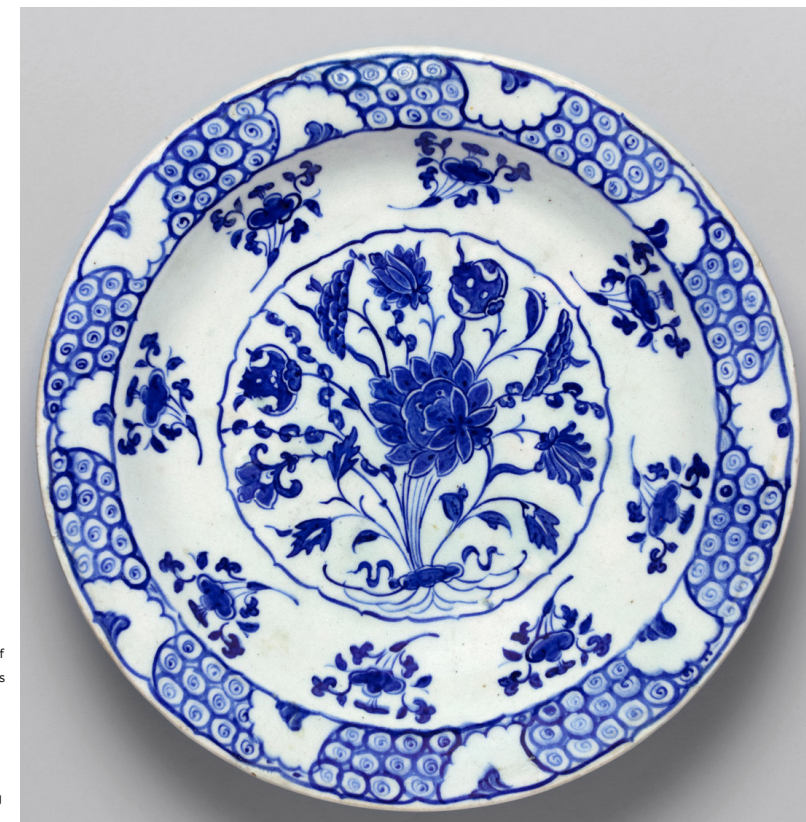
Dish with bouquet of blue-and-white lotus Iznik, Turkey ca. 1570-1575 Siliceous ceramic, underglaze painting over a slip of coating Louvre Abu Dhabi

Curriculum links: Islamic Studies , Arabic Language , Arts , History , Geography , Social Studies , Mathematics