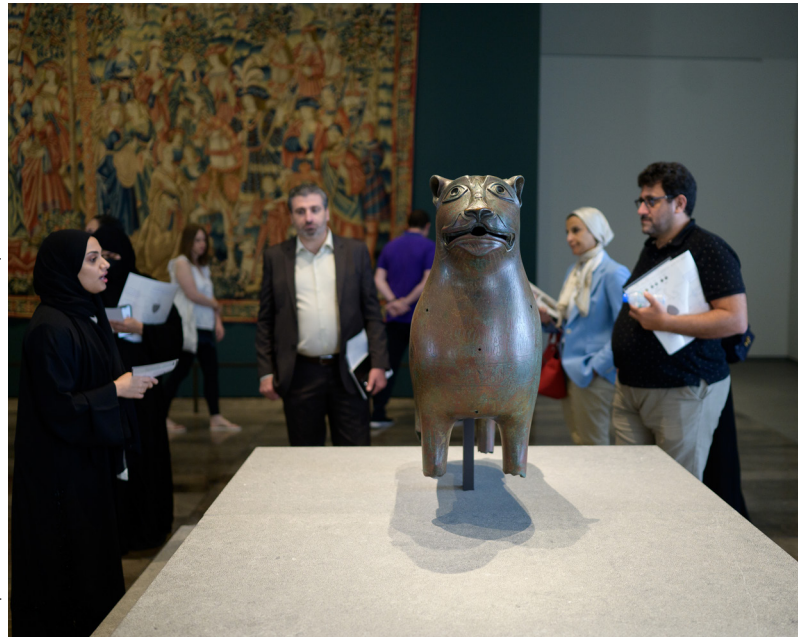
© Department of Culture and Tourism – Abu Dhabi / Photo Siddharth Siva

*One training session AED 250 plus one Self-Led visit voucher AED 125.